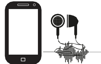
Unauthorized use of electronic/virtual device