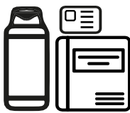
Written notes on personal items